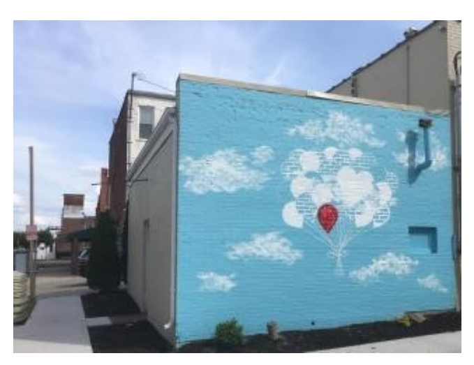
More happiness in Maysville!